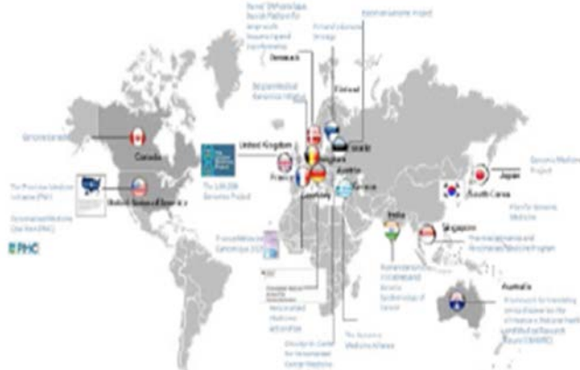
Plans and Strategies in Personalised, Precision, or Genomic Medicine