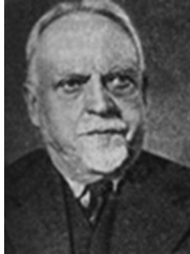
Nikolai Alexandrovich Semashko 1874-1949