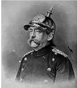
Otto von Bismarck 1815-1898